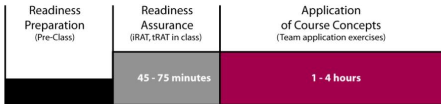
Figure 2: Typical Timeline for a TBL Unit

teams, faculty are always present and available to provide a “mini-lecture” over material that teams find difficult to master.